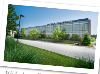
We had an all time high mission's giving in 2012! 38% of disbursements went to missions!