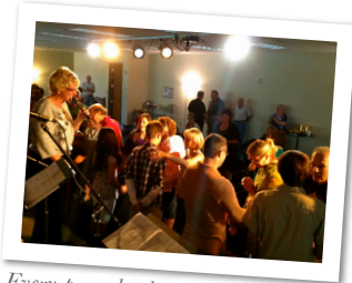
Every pre-school to college student was prayed for on Student Sunday.